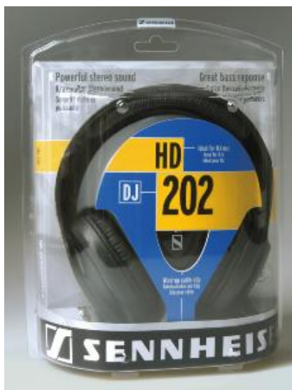
HD 202 régi csomagolás