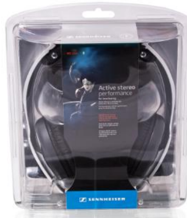
HD 203 új csomagolás