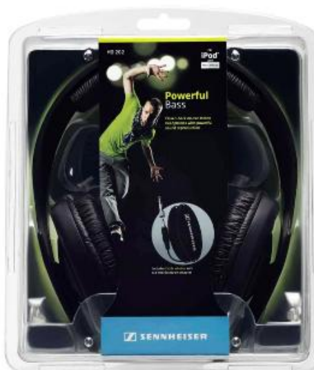
HD 202 új csomagolás