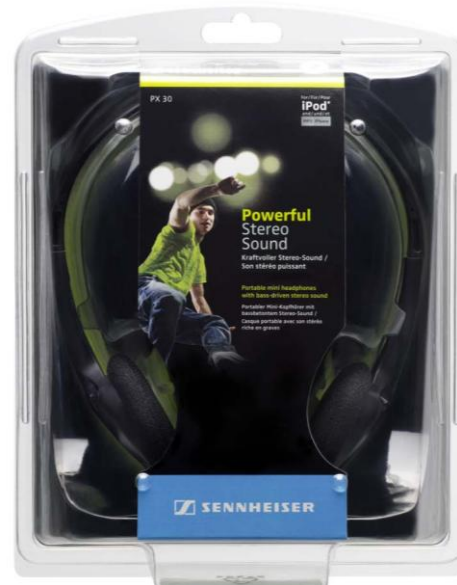
PX 30 új csomagolás