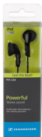
MX 160 régi csomagolás