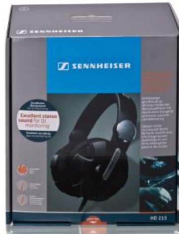
HD 215 új csomagolás