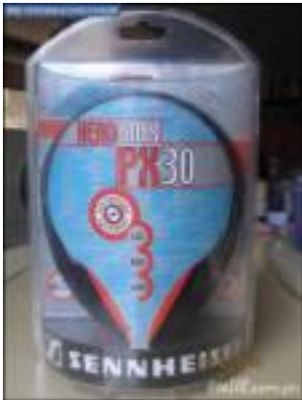
PX 30 régi csomagolás