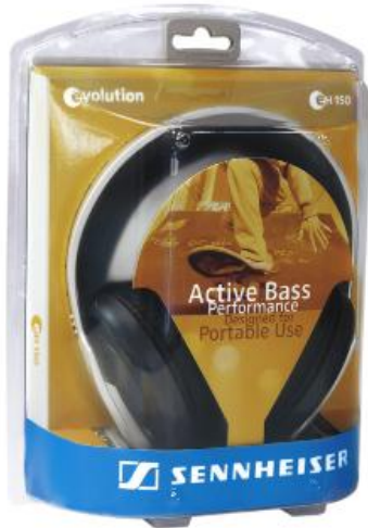
eH 150 régi csomagolás