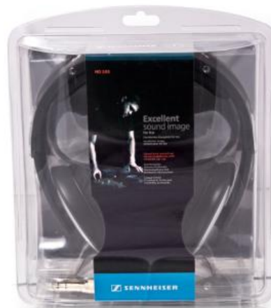
HD 205 új csomagolás