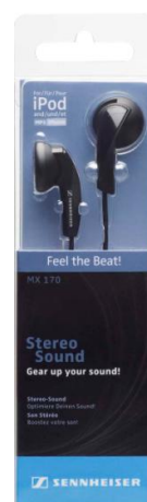
MX 170 új csomagolás