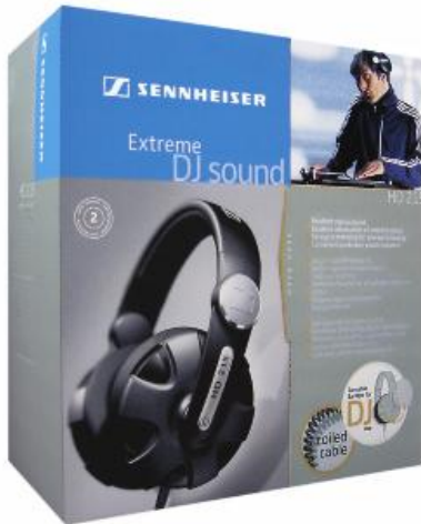
HD 215 régi csomagolás