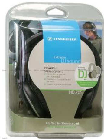
HD 205 régi csomagolás