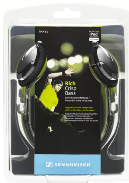
PMX 60 új csomagolás